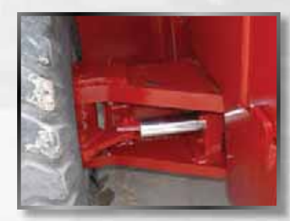
Heavy-duty steer axle is a single hydraulic cylinder design with heavy-duty links from the cylinder ram directly to tapered roller bearing mounted spindles.

Sliding engine hood Easily removable for greater access (All service and daily checks can be made easily from running boards)