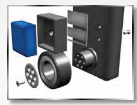
The mast and carriage main rollers are common and use Timken® tapered roller bearings. Chain rollers use sealed ball bearings. Common, cast nylon, side thrust pads are adjustable to compensate for wear.