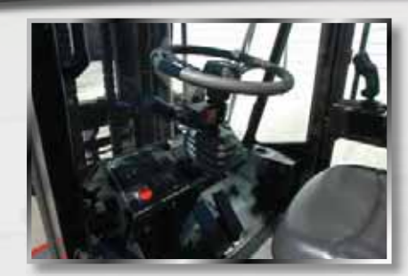
Spacious uncluttered cab with tilt steering, hinge-down dash, climate controls and adjustable seating Premium vinyl or cloth seat that rotates 15° left and 20° right

This blend of ergonomics and technology will help your operator be more efficient with the job at hand... handling materials.