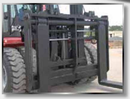
The pin-mounted forks are hammer forged from heat treated steel with increased thickness in critical heel sections. The forks are fully adjustable from full width of carriage to +/-2-in. Lengths and widths vary depending on your particular needs and model type.

*Caution should always be taken when moving any load. Please refer to manual for proper procedures before removing the counterweight.