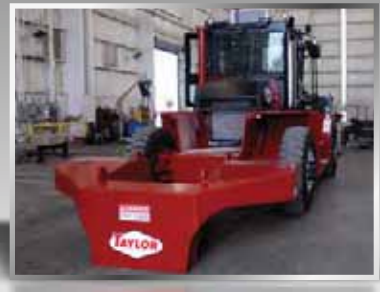
Feat ur es...