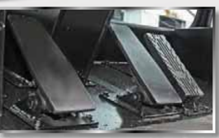
Two brake pedals left – brakes and inching right – brakes only