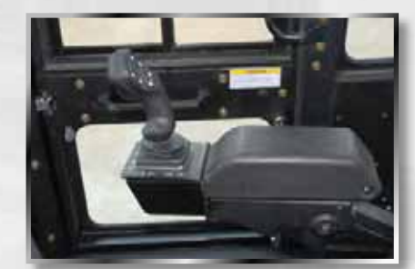
Comfortable adjustable arm rest with fingertip joystick control for smooth precise handling

The TX-550RC features a spacious, all steel cab with increased leg and head room, sound deadening rubber mat flooring, tilt steering wheel, simple T-shaped dash with hinge down instrument panel, fingertip electric joystick controls, and optional climate control system for operator comfort and convenience.