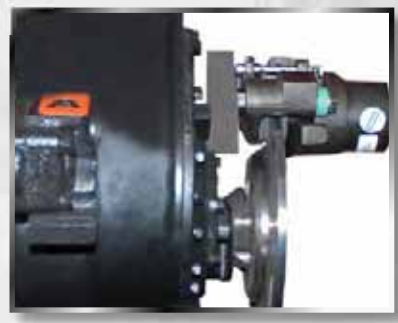
Transmission output shaft disc mounted, parking brake Spring on – Hydraulic off Instrument panel mounted