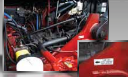
A simple manual cab tilt pump is standard with an optional powered cab tilt pump available