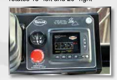
Easy to understand diagnostic display. TICS (Taylor Integrated Control System) using CANbus technology is standard on the TX-550RC