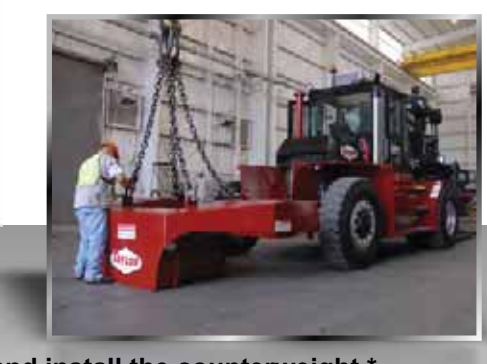
The 4 removable pins and 4 lifting eyes make it easy to remove and install the counterweight.* *Caution should always be taken when moving any load. Please refer to manual for proper procedures before removing the counterweight