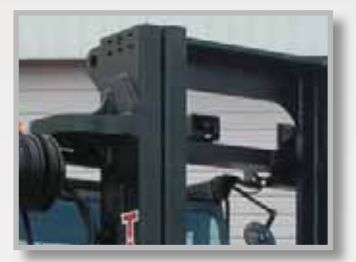
Forward activated alarm

Overhead work lights for improved safety and visibility