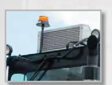
Key-switch actuated amber strobe light