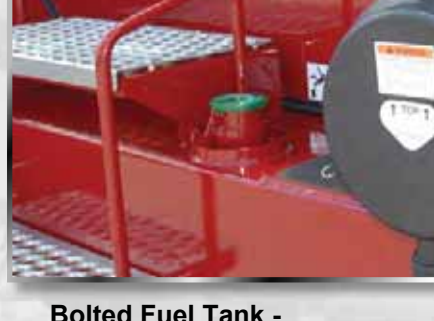
Bolted Fuel Tank -