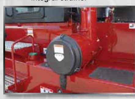
Dual element air cleaner with restriction indicator