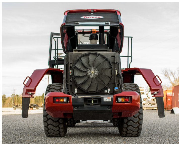
The rear full fenders swing out for easy access to the engine compartment. The electrically actuated, wide opening fiberglass hood of the Taylor T-1023 gives you easy access to the engine and its easy-to-reach service points. The radiator also swings out for ease of service.