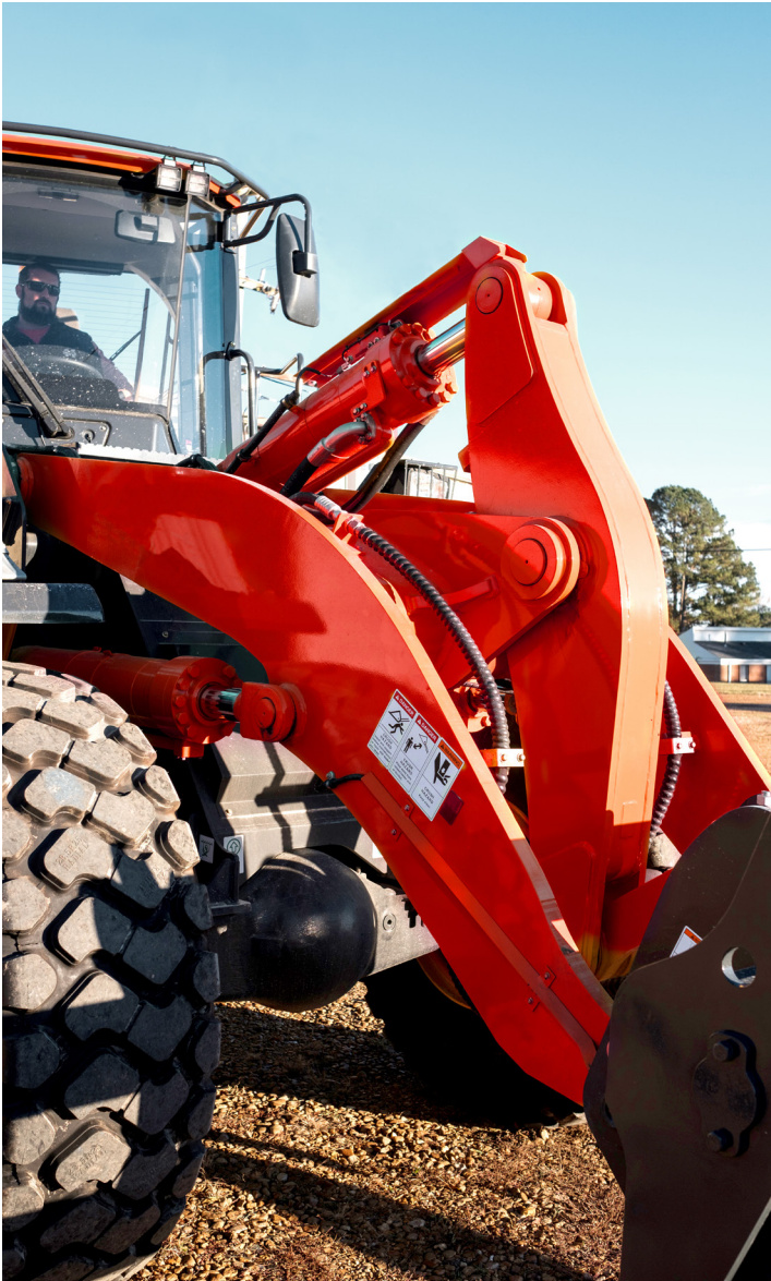
The Taylor T-1023 features optimized Z-Bar geometry that positions the bucket closer to the tires, achieving high bucket breakout forces with maximum rollback. The option of hydraulic quick coupler attachment adds versatility to Z-Bar machines, allowing use of multiple tools to suit the job-site needs.