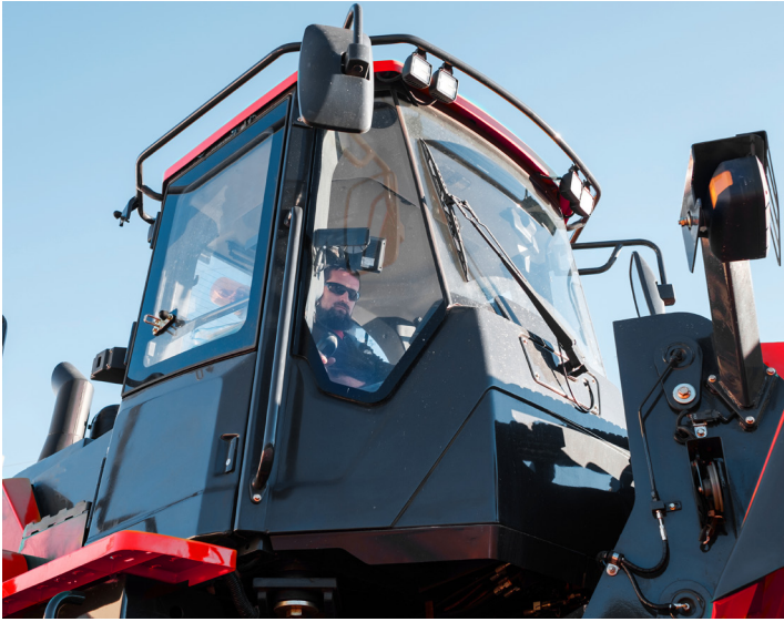
The Taylor T-1023 has been designed to offer optimized visibility. A panoramic view cab with curved front glass has been paired with well-positioned lift arms to allow the operator a clear line of sight to the attachment at ground level.