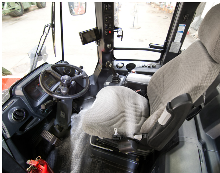
Ergonomically designed controls, increased visibility and convenient features all contribute to operator comfort and overall productivity on the jobsite. Air conditioning is standard