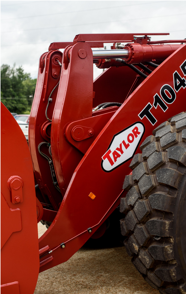
The Taylor T-1045 features optimized Z-Bar geometry that positions the bucket closer to the tires, achieving high bucket breakout forces with maximum rollback. The option of hydraulic quick coupler attachment adds versatility to Z-Bar machines, allowing use of multiple tools to suit the job-site needs.