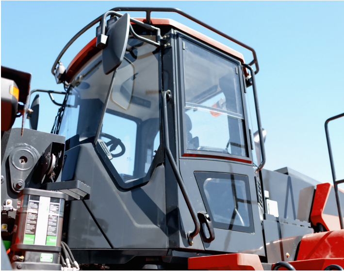
The Taylor T-1045 has been designed to offer optimized visibility. A panoramic view cab with curved front glass has been paired with well-positioned lift arms to allow the operator a clear line of sight to the attachment at ground level.