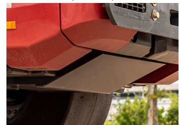
Skid Plates & Hinged Belly Pans (Standard)