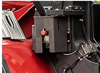
Auto-Lube with Protective Guarding (Standard)

Ergonomically designed controls, 4-way adjustable steer column and convenient features all contribute to operator comfort and overall productivity on the jobsite. Air conditioning is standard.