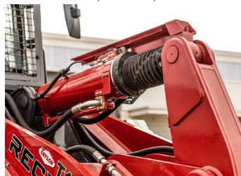
Protective Boots for Cylinder Rods (Standard)