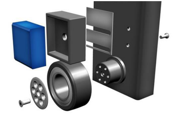
The mast and carriage main rollers are common and use tapered roller bearings. The side thrust pads, made from cast nylon, are adjustable to compensate for wear.