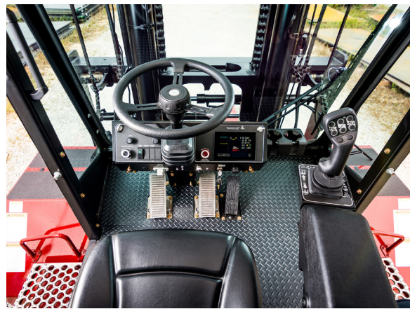
Fully Enclosed 2-Door Tilting Cab with Multiple Climate Control Configurations Available (featured cab is shown with available options)