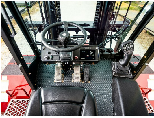
Fully Enclosed 2-Door Cab with Multiple Climate Control Configurations Available (featured cab is shown with available options)