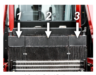
3-Section Bolted Radiator (Each section can be serviced separately)