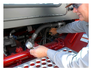
Service & Inspection from Ground Level