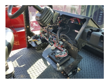
Flip-down Dash with Color/Number Coded Wiring (Standard)

Taylor Lift Trucks are designed with ease of maintenance and serviceability as a key priority. With today's engine and emissions requirements, daily maintenance checks and timely periodic service are the key to your equipment's longevity. All daily checks across the Taylor product line can be accessed from the ground or running board, ensuring that operators can complete these requirements with ease. Also, the sliding hood (on rollers), side service doors and 70 degree tilting cab open to expose the drive train and hydraulics to provide easy access for service and inspection.