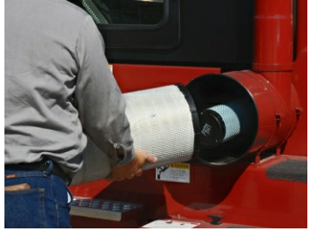
Donaldson Air Cleaner with Safety Element (Standard)