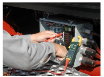
Heavy Duty Circuit Breakers/Reset Switches (Standard)