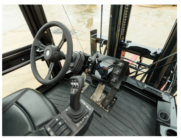
Fully Enclosed 2-Door Cab with Multiple Climate Control Configurations Available (featured cab is shown with available options)