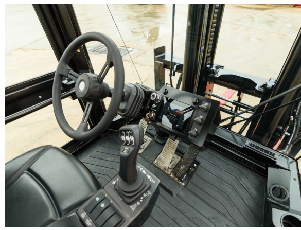
Fully Enclosed 2-Door Cab with Multiple Climate Control Configurations Available (featured cab is shown with available options)