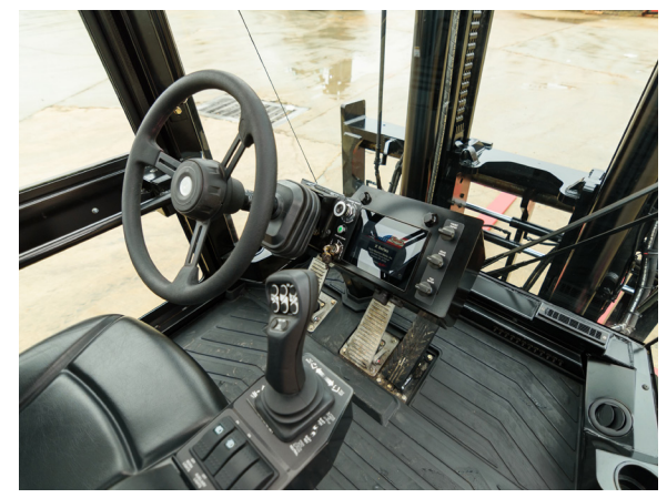
Fully Enclosed 2-Door Cab with Multiple Climate Control Configurations Available (featured cab is shown with available options)