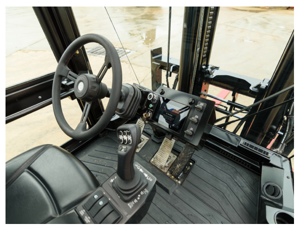
Fully Enclosed 2-Door Cab with Multiple Climate Control Configurations Available (featured cab is shown with available options)