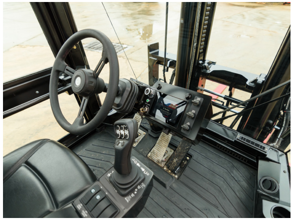
Fully Enclosed 2-Door Cab with Multiple Climate Control Configurations Available (featured cab is shown with available options)