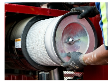
Donaldson Air Cleaner with Safety Element