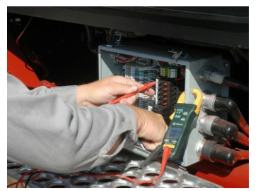
Heavy Duty Circuit Breakers/Reset Switches (Standard)