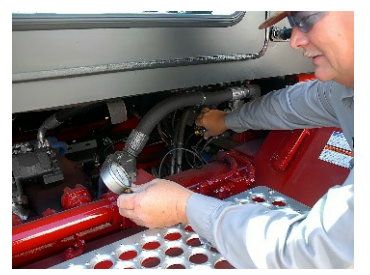
Service & Inspection from Ground Level