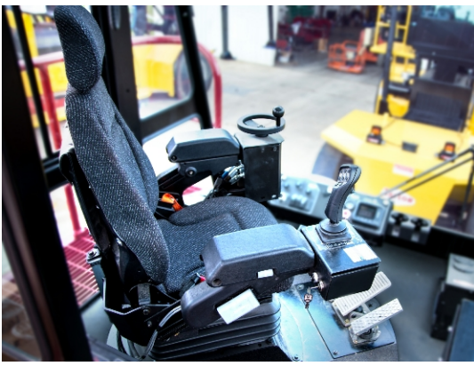
Fully Enclosed 2-door Cab - 180° Rotating Operator Platform (Standard)