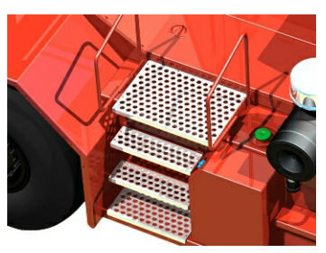
Easily Replaceable Bolted Steps & Handrails