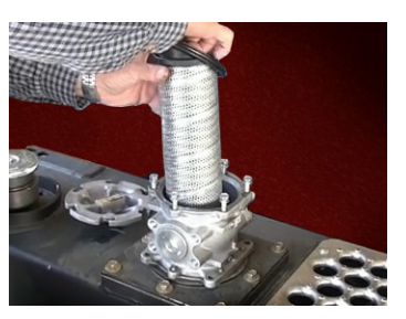
Spin-on Breather, Wire Mesh Strainer & Replaceable Internal Element (Standard)