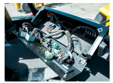
Flip-down Dash with Color/Number Coded Wiring

Taylor Lift Trucks are designed with ease of maintenance and serviceability as a key priority. With today's engine and emissions requirements, daily maintenance checks and timely periodic service are the key to your equipment's longevity. All daily checks across the Taylor product line can be accessed from the ground or running board, ensuring that operators can complete these requirements with ease. Also, the gull-wing hood and side service doors open to expose the drive train and hydraulics to provide easy access for service and inspection.