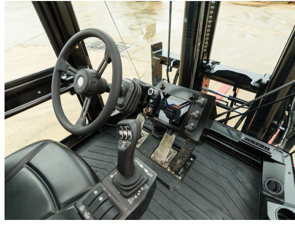
Fully Enclosed 2-Door Cab with Multiple Climate Control Configurations Available (featured cab is shown with available options)