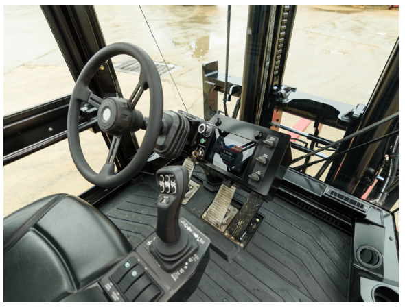
Fully Enclosed 2-Door Cab with Multiple Climate Control Configurations Available (featured cab is shown with available options)