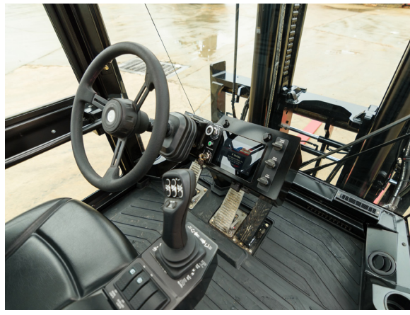
Fully Enclosed 2-Door Cab with Multiple Climate Control Configurations Available (featured cab is shown with available options)