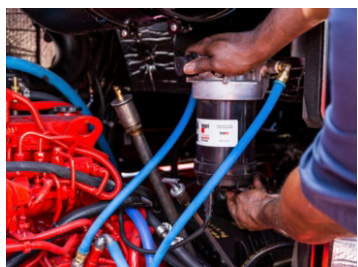
Easy Access to Fuel / Water Separator