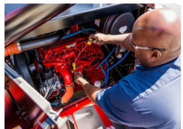
Easily Accessible Daily Checks