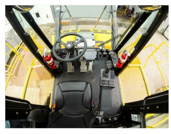
Fully Enclosed 2-door Cab - All Steel - 32,000 BTU Heater (Standard)