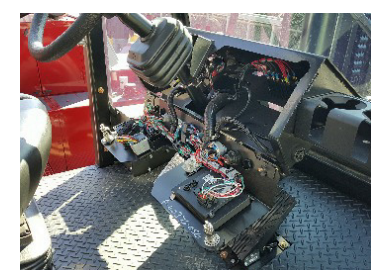
Flip-down Dash with Color/Number Coded Wiring (Standard)

Taylor Empty Container Handlers are designed with ease of maintenance and serviceability as a key priority. With today's engine and emissions requirements, daily maintenance checks and timely periodic service are the key to your equipment's longevity. All daily checks across the Taylor product line can be accessed from either the ground or running board, ensuring that operators can complete these requirements with ease. Also, the side service doors and removable deck panels open to expose the drivetrain and hydraulics to provide easy access for service and inspection.