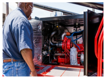
Service & Inspection from Ground Level