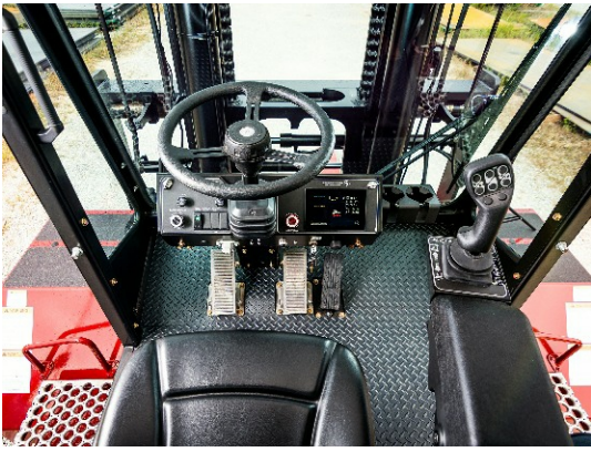
Fully Enclosed 2-Door Cab with Multiple Climate Control Configurations Available (featured cab is shown with available options)