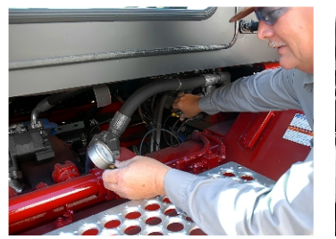
Service & Inspection from Ground Level