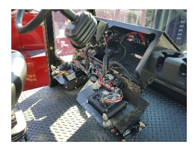
Flip-down Dash with Color/Number Coded Wiring (Standard)

Taylor Lift Trucks are designed with ease of maintenance and serviceability as a key priority. With today's engine and emissions requirements, daily maintenance checks and timely periodic service are the key to your equipment's longevity. All daily checks across the Taylor product line can be accessed from the ground or running board, ensuring that operators can complete these requirements with ease. Also, the sliding hood (on rollers), side service doors and 70 degree tilting cab open to expose the drive train and hydraulics to provide easy access for service and inspection.