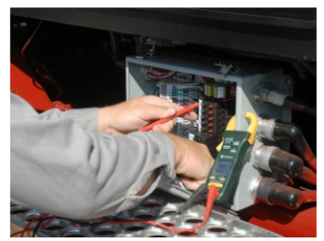
Heavy Duty Circuit Breakers/Reset Switches (Standard)