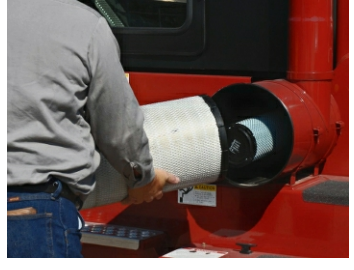
Donaldson Air Cleaner with Safety Element (Standard)