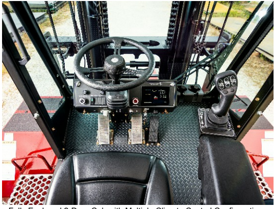
Fully Enclosed 2-Door Cab with Multiple Climate Control Configurations Available (featured cab is shown with available options)