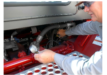
Service & Inspection from Ground Level