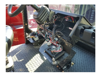
Flip-down Dash with Color/Number Coded Wiring (Standard)

Taylor Lift Trucks are designed with ease of maintenance and serviceability as a key priority. With today's engine and emissions requirements, daily maintenance checks and timely periodic service are the key to your equipment's longevity. All daily checks across the Taylor product line can be accessed from the ground or running board, ensuring that operators can complete these requirements with ease. Also, the sliding hood (on rollers), side service doors and 70 degree tilting cab open to expose the drive train and hydraulics to provide easy access for service and inspection.