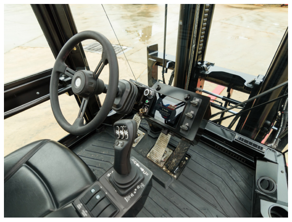
Fully Enclosed 2-door Cab - All Steel - 32,000 BTU Heater (Standard)