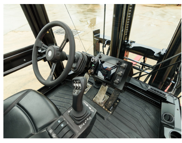
Fully Enclosed 2-door Cab - All Steel - 32,000 BTU Heater (Standard)