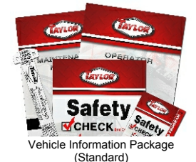
Vehicle Information Package (Standard)