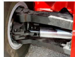
Industry's Toughest Steer Axle (Standard)